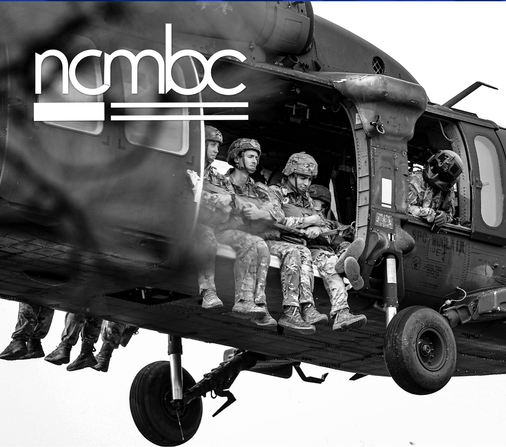
Army paratroopers conduct airborne operations from a UH-60 Black Hawk helicopter at Fort Liberty.