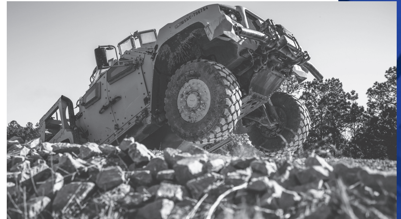
Marines operate a joint light tactical vehicle through various obstacles and terrain designed to enhance driving expertise during a combat vehicle operations training course at Camp Lejeune.