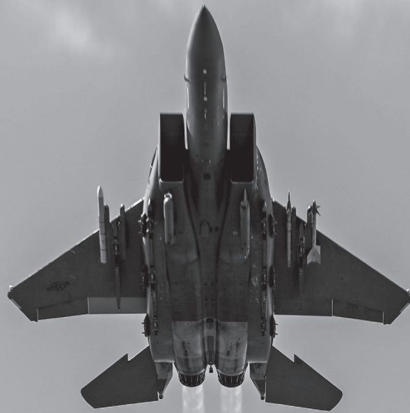
An F-15E Strike Eagle takes off from Seymour Johnson Air Force Base. The F-15E is a dual-role fighter designed to perform air-to-air and air-to-ground missions.