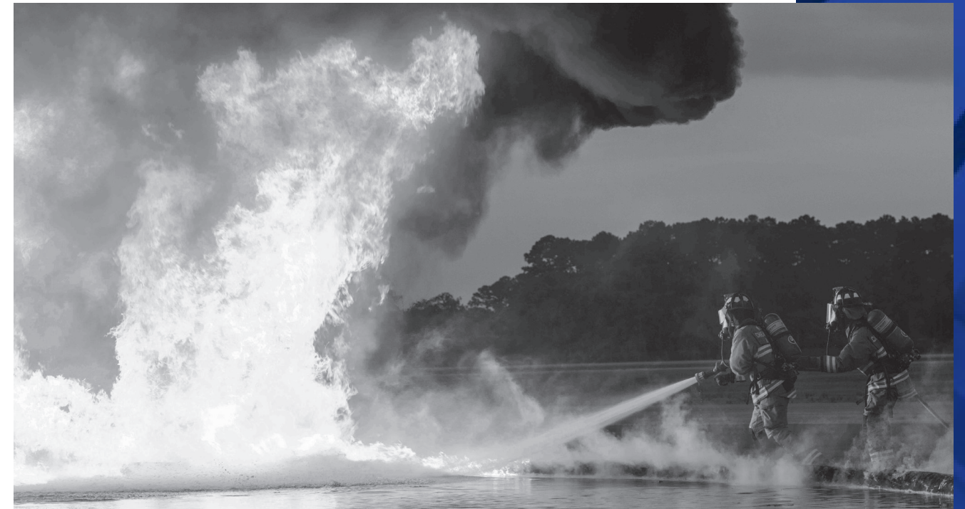
Marines participate in a burn drill training event at Marine Corps Air Station Cherry Point.