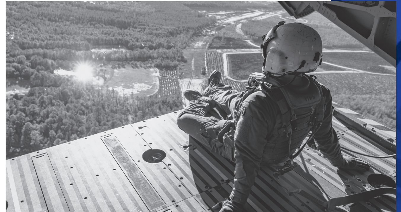
Marine observes the terrain during a flight to Marine Corps Air Station New River after participating in training at Wilmington International Airport in Wrightsboro, North Carolina.