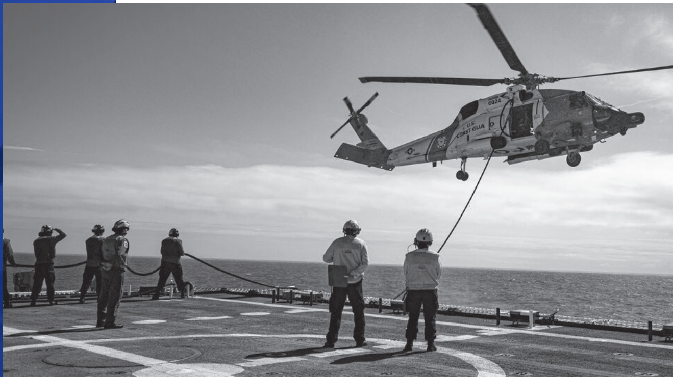
Crewmembers from the US Coast Guard Cutter Calhoun conduct an in-flight refueling with an MH-60 helicopter crew from Coast Guard Air Station Elizabeth City.