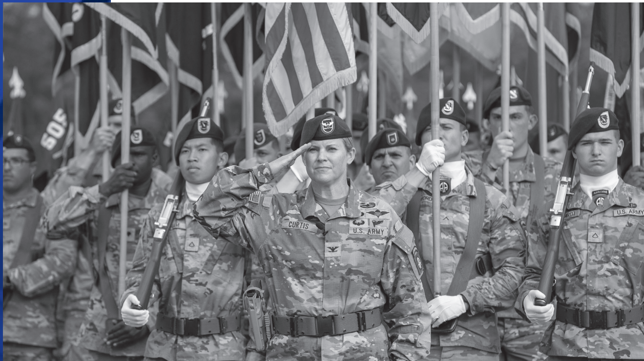
The colors of the 82nd Airborne Division are presented during a change of command ceremony at Fort Liberty.